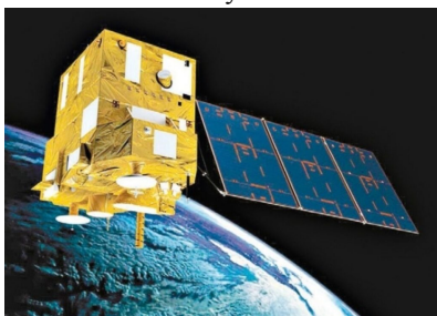
Fig. 2. CBERS-04A

Among the remote sensing applications, the programme made reference to the launching of the first China-Brazil Earth-Resources Satellites (CBERS) as a concrete goal. Planned to be launched in 1997, the first satellite of the series was launched in 1999, and the second launch was only in 2003.