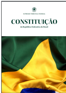
Fig. 1. Brazilian Federal Constitution by STF

the AEB Ordinance No. 698, of 31 August 2021 institutes the Brazilian Space Regulation (REB, Portuguese acronym) for the Operator's Licence for Space Activities and the Launch Authorization in the Brazilian Territory [8].