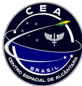
Fig 3. CEA logo

PNAE 2005-2014's priorities were summarised in ten items: a) continuation of the national Satellite Launch Vehicle; b) maintenance and update of the Brazilian Data Collection System, eliminating the need for specific satellites; c) completion of the Multimission Platform project and its payloads; continuation of the CBERS projects; d) implementation of the Alcântara Space Centre's (CEA) infrastructure and commercial launching spots; e) investments in research and development, focused on the management of critical technologies, with the participation of academia and industry; f) adoption of projects that met the demands of national activities in Earth Observation, Scientific and Technological Missions, Telecommunications, and Meteorology; g) maintenance, and escalation to industry level, of the successful sounding rocket programme; h) increasing the participation of domestic industry in development activities and projects covered by the programme; and i) adoption of international cooperation instruments that involved technology transfer and coincided with national interests [12].